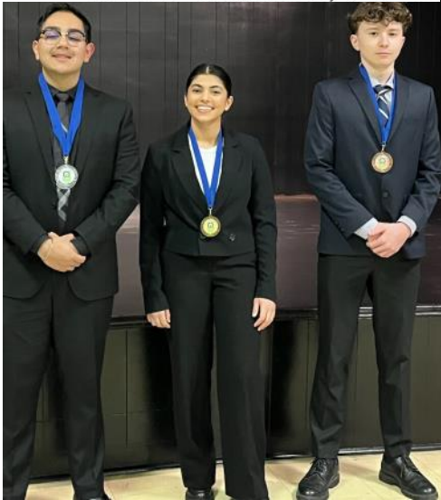
Etobicoke Optimists held their club Oratorical Contest on April 4th. Pictured are the winners:

Optimist Club of Toronto-Etobicoke, Ontario