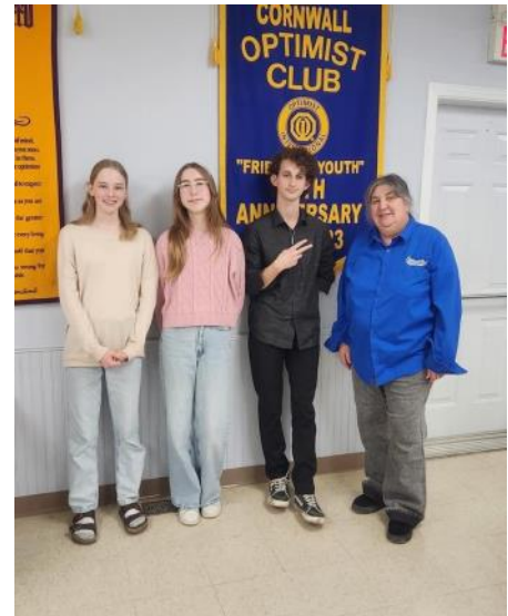
Cornwall Optimists held their Club Oratorical competition.