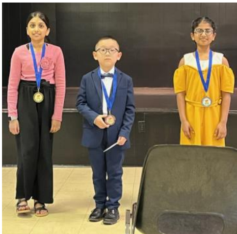
Etobicoke Optimists held their club Kids Speak Out Program on April 4th. Pictured are the winners: